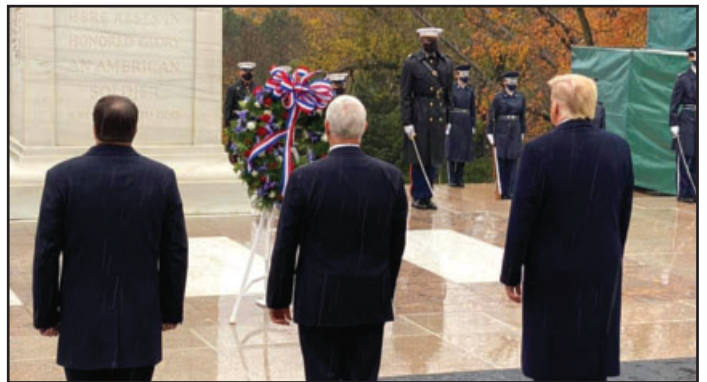
U.S. President Trump (R), Vice President Pence (C), and unidentified dignitary at Arlington National Cemetery on Veterans Day 2020