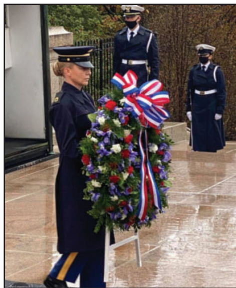
Placing of the Veterans Day wreath at Arlington National Cemetery