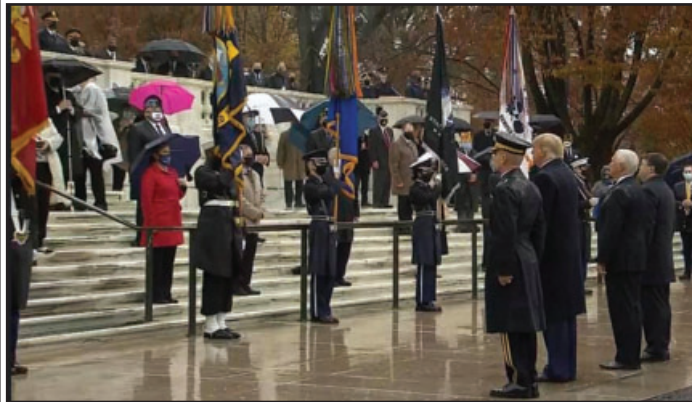
Dignitaries and guests gather at Arlington National Cemetery on Veterans Day 2020