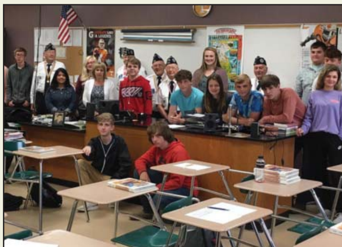
Students, faculty, and Ch. 297 members at Stone Memorial High School